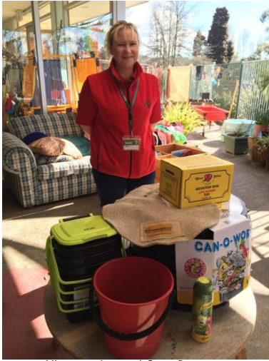
All items donated from Bunnings