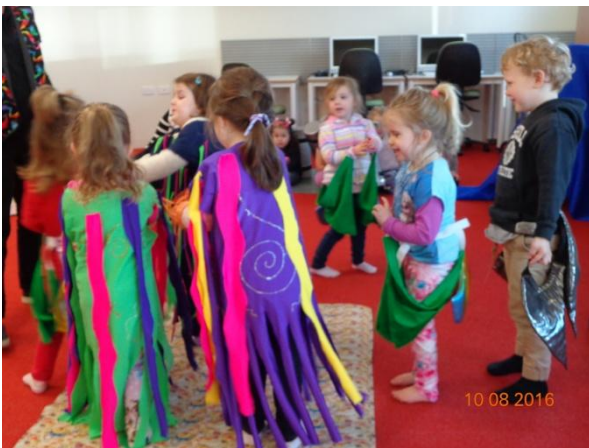
Drama Tool Box- Under The Sea