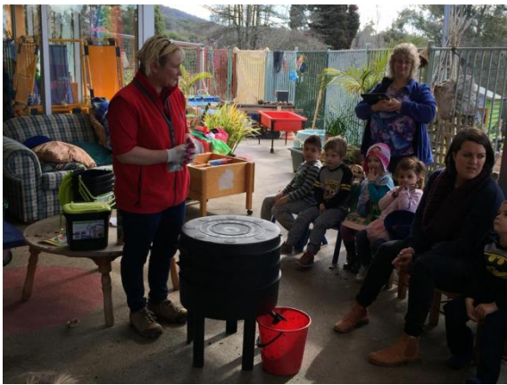
Children learning about composting