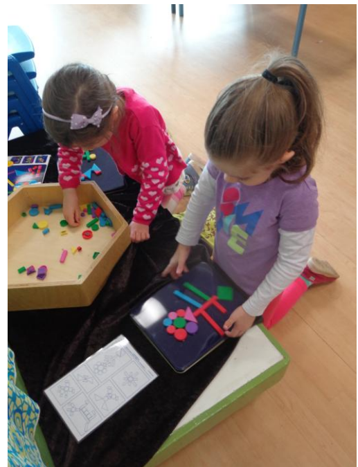
Shapes and Colours