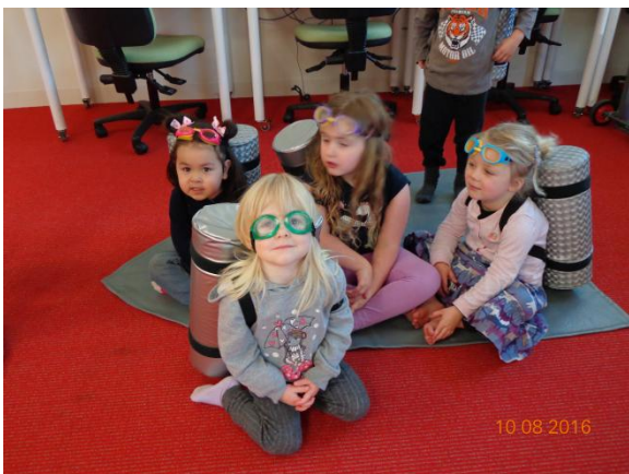
Deep sea divers!